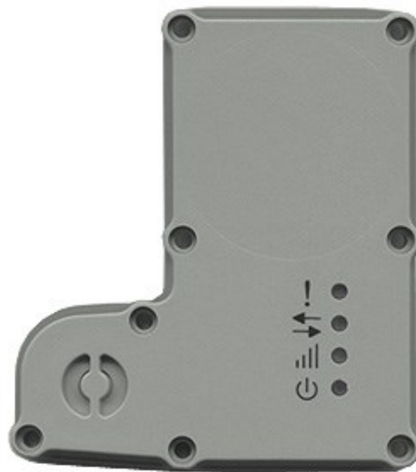
Figure 2.2 Led indicators