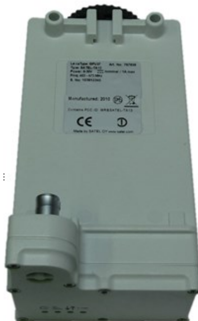
Figure 1.1 GFU30 radio data modem

GFU30 is a UHF radio transceiver modem. It provides a transparent data link with other GFU or SATELLINE-3AS and -EASy family modems.